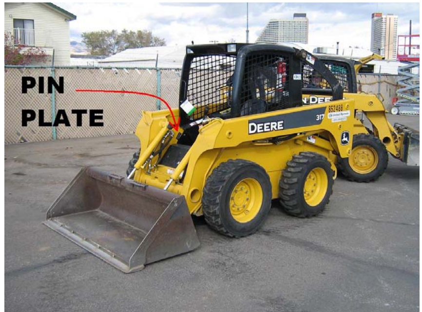
Image of similar machine at right: note PIN plate is in the forward portion of the operator's compartment

Law Enforcement offenders may be in possession of equipment by fraudulent means, which is not reported "stolen". NCIC cannot verify equipment is NOT stolen- verify equipment's status with owners. To locate an owner, and for identification assistance and access to NER's databases, contact NICB: